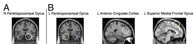
Fig. 3. Resting-state functional connectivity results following the specificity induction compared with the control induction for (A) a left anterior hippocampal seed region (extracted from a peak voxel xyz of -34, -16, -12 ) and (B) a right inferior parietal lobule seed region (extracted from a peak voxel xyz of 38, -32, 36 ) and the rest of the brain at a threshold of P < 0.001 , uncorrected (with an extent threshold of 38 voxels, yielding a corrected threshold of P < 0.05 ).

Nonetheless, we are cautious in interpreting too heavily the precise location of increased induction-related activity within the hippocampus. Several factors can influence the location of hippocampal activity (reviewed in ref. 34), and work from the spatial cognition domain on the anterior–posterior hippocampal axis suggests that the anterior hippocampus supports coarse-grained (vs. fine-grained) representations, at least those that are spatial (refs. 35, 36; reviewed in ref. 37). The anterior hippocampus has also been associated with the encoding of novel simulations into memory (38). However, if the induction simply helped participants to encode novel representations into memory, we would have